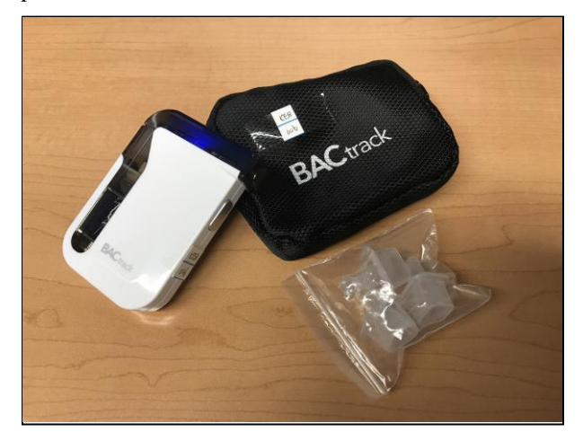
Figure 1. BACtrack Mobile Pro

The BACtrack Mobile Pro is the only consumer breathalyzer that has been developed and released by the FDAapproved company BACtrack. It is designed to monitor and manage one's BAC and drinking habits by linking to a smartphone or a smartwatch. It has additional functions such as calling Uber<sup>25</sup>. The Figure 1 shows a BACtrack Mobile Pro that was given to a participant for this research.